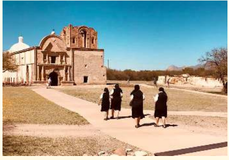
The Sisters from St. Peter Indian Mission, Bapchule, Arizona took an Emmaus trip Easter Monday traveling to a mission founded by Jesuit Padre Eusebio Kino—Tumacacori in Tubac, AZ.