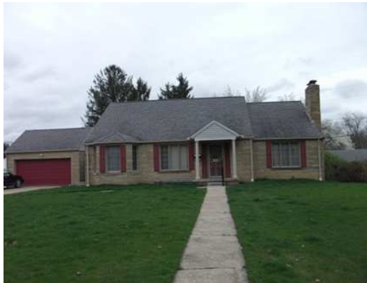
All are welcome to our new home! Good Samaritan Convent, 2654 Ridgewood Circle, Zanesville.

Zanesville, Ohio—After residing for the past twenty years at 833 Adair Avenue, the Franciscan Sisters are now living at Good Samaritan Convent located at 2654 Ridgewood Circle in Zanesville.