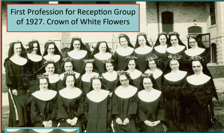
First Profession for Reception Group of 1927. Crown of White Flowers

Bold Print: Living Members. Underlined: Community Directors