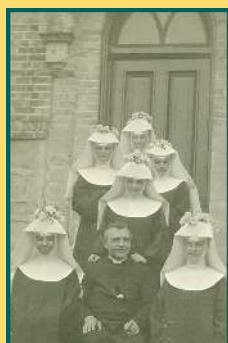
This 1918 Reception group shows the crown of white flowers worn for three days. They are kneeling outside the East Entrance.