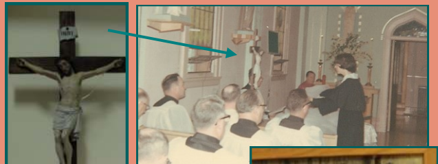
Reception: Placing the veil at the feet of Jesus before receiving the new habit and veil.