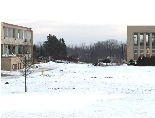
December 28, view from the west side. Notice pine trees in middle cemetery.