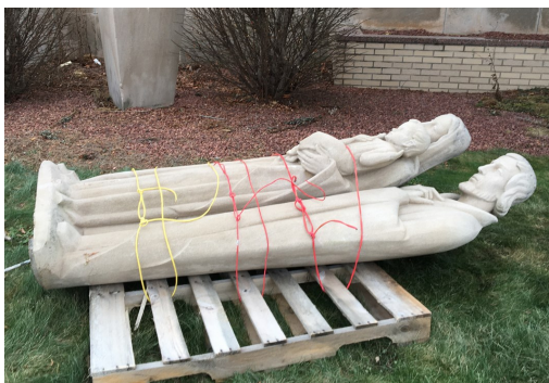
December 6, statue of the Holy Family is down and stored for the winter.