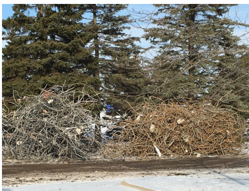
December 19, after concrete is crushed rebar is piled for salvage.