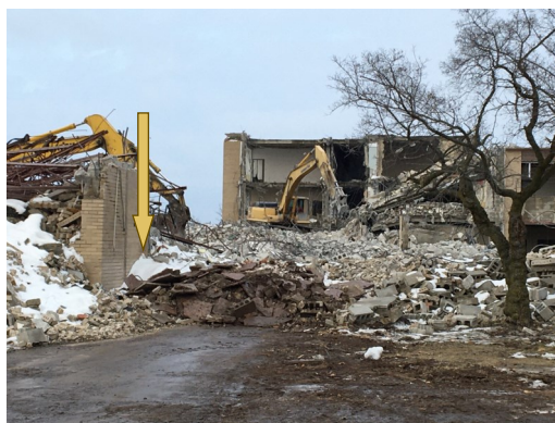
December 29, crushing concrete and salvaging rebar. Arrow—art entrance.