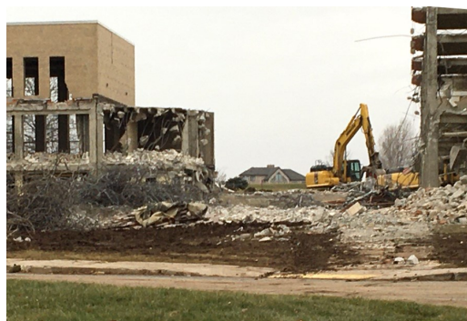
December 13, patio lounge, cafeteria and kitchen are down.