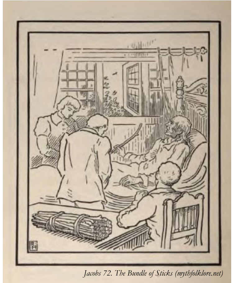
Jacobs 72. The Bundle of Sticks ( mythfolklore.net )

"My Sons," said the Father, "do you not see how certain it is that if you agree with each other and help each other, it will be impossible for your enemies to injure you? But if you are divided among yourselves, you will be no stronger than a single stick in that bundle."