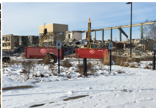
December 19, demolition of library and art department.