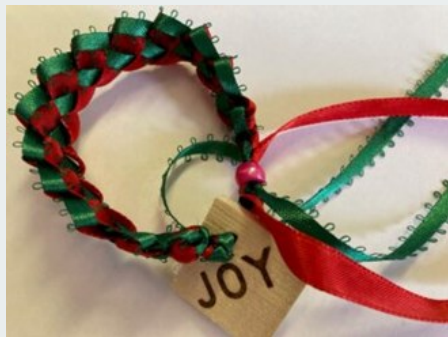
San Lucia Discernment Prayer

Crowned with a circle aglow. Women shining with the Light who comes, Comes in Word, in silence, in beauty, in song, in Sacrament, He circles round us, circles with us, encircles us with love, rounds out our thoughts with His Spirit of Wisdom. May circles lead us eternally around His Presence spiraling ever deeper within. Wear this circle of braid as reminder that you are called to be entwined in the circle of His Light and love.