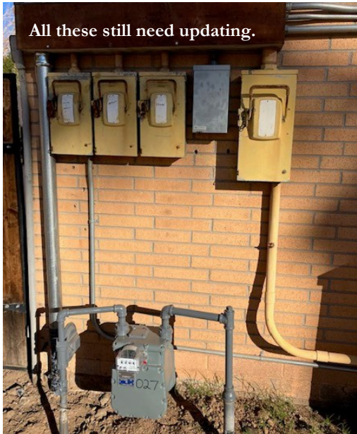
All these still need updating.