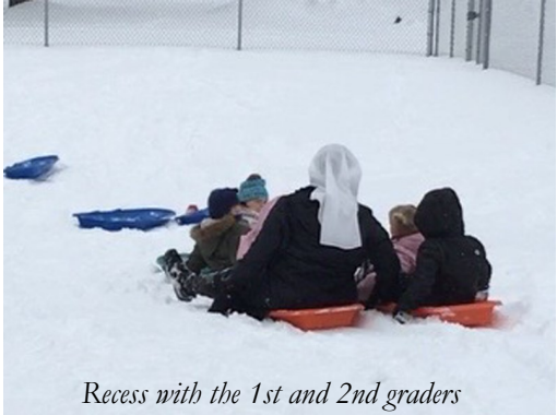
Recess with the 1st and 2nd graders